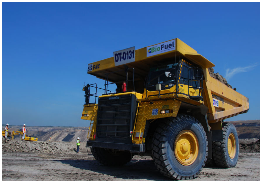
The HD785 dump truck in test operation